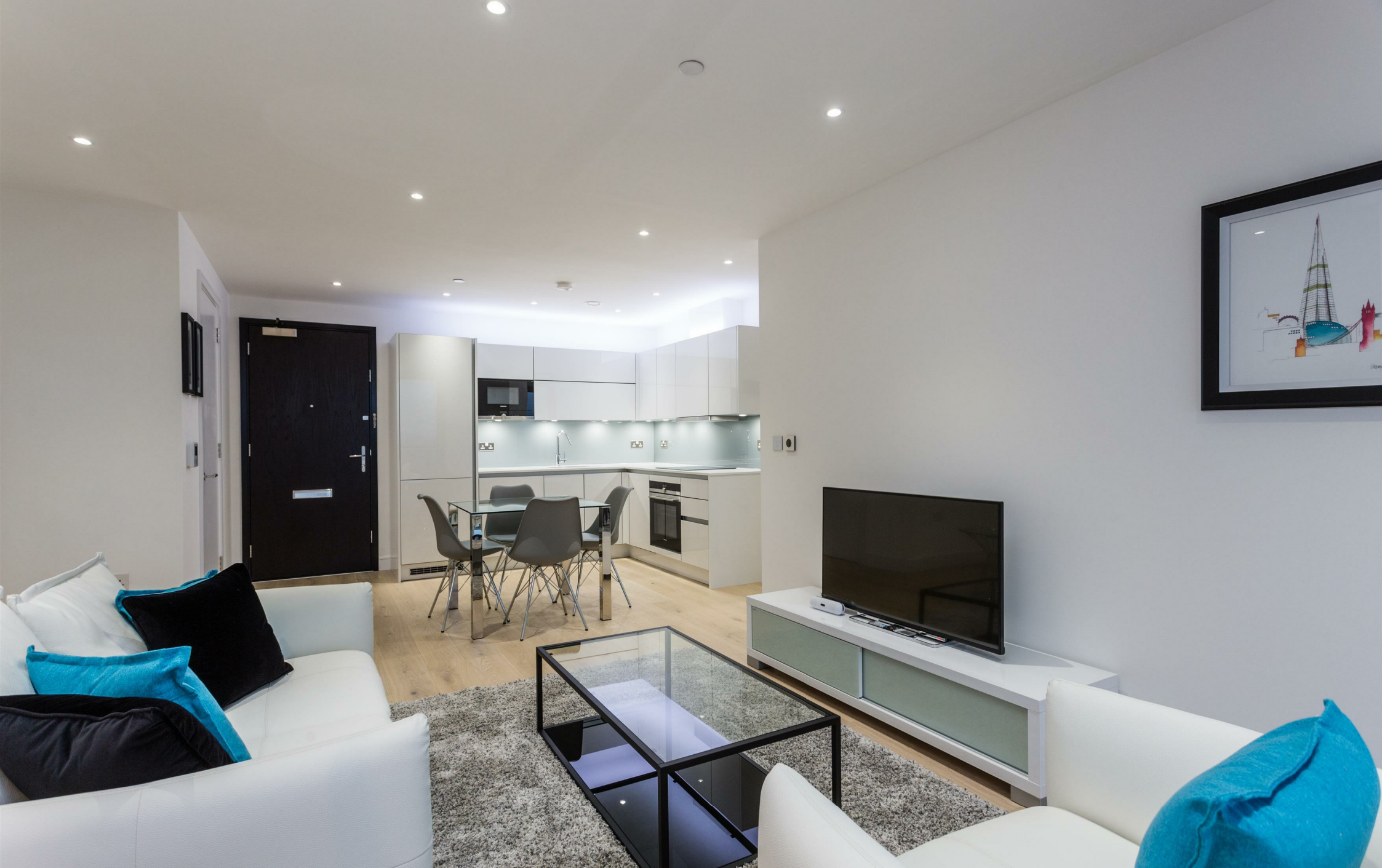
1305 Heritage Tower London, E14 3NW £575 Per Week